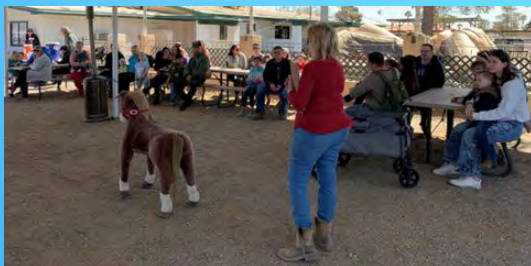
Pictures from Children's Horseback Riding with Horses For Hero's on 18 MARCH 2023

Sign Ups are now open for the following events: Teen/Adult Leather Stamping, Children's ChalkCouture, Family Kids Town Sensory Event (see flyers for more information)